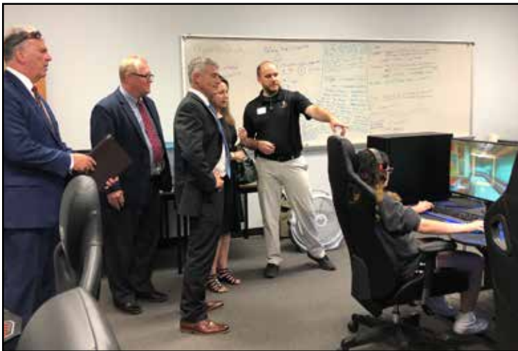
The Caslens learn about and meet members of USC Sumter's Fire Ant eSports team.