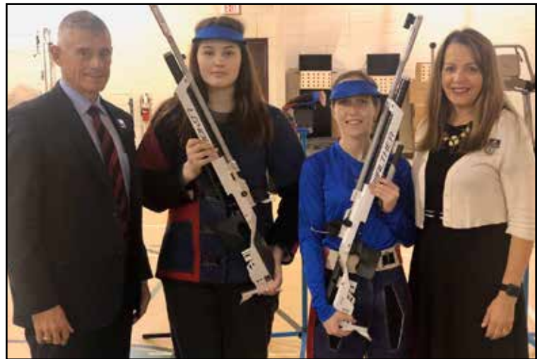
The Caslens meet members of USC Union's new rifle team.