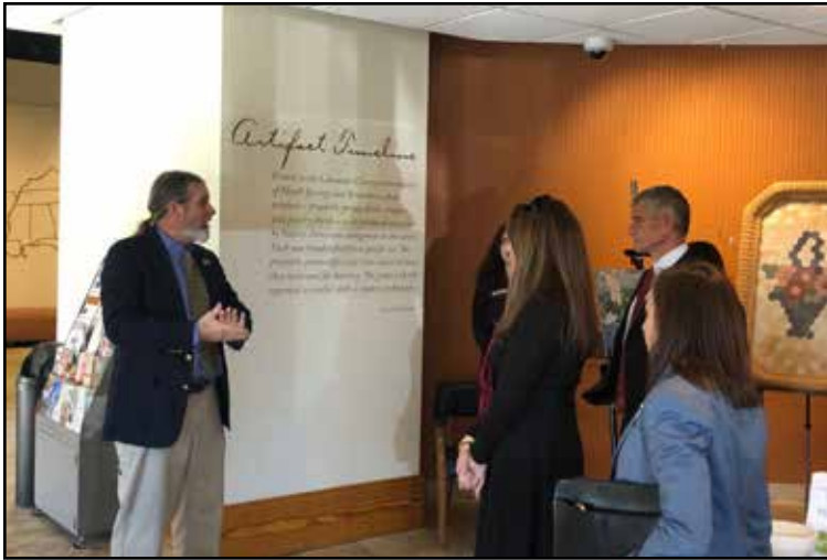
The Caslens tour the Native American Studies Center at USC Lancaster.