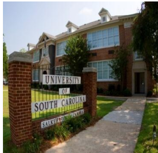
USC – Salkehatchie