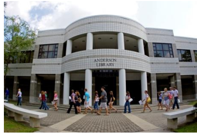
USC – Sumter