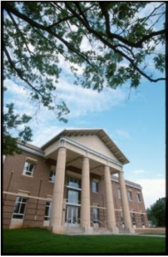
USC - Lancaster